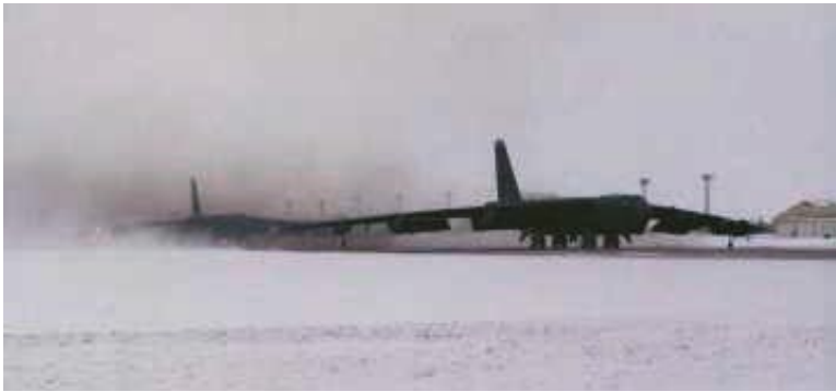
B-52s perform minimum interval takeoffs in response to tactical warning.

possible that communications may be degraded to the point that it is difficult to pass critical information or send orders to the field.