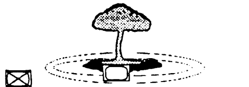
Initial nuclear effects on a dispersed unit

By achieving surprise, the enemy's opportunity to use WMD are reduced. The proliferation of modern surveillance device makes achieving outright surprise more difficult. Use of obscurants can assist the commander in achieving tactical surprise. Visual and infrared obscurants can defeat or hamper many battlefield surveillance and targeting systems.