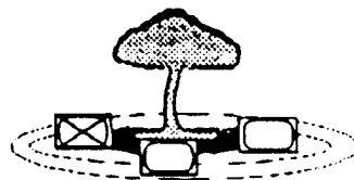
Initial nuclear effects on a massed unit

purpose of the offense is to defeat, destroy, or neutralize the enemy force. Because tactical offensive operations often expose the attacker, they normally require local superior combat power at the point of the attack. Massing of combat power can create a window of vulnerability to enemy WMD.