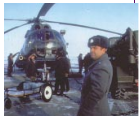
Russian MI-8 during combined search and rescue exercise.