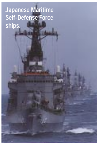
Japanese Maritime Self-Defense Force ships.