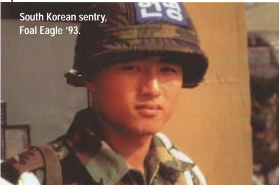
South Korean sentry, Foil Eagle '93.