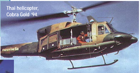
Thai helicopter, Cobra Gold '94.